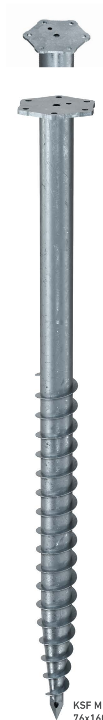
KSF M 76x1600-M16