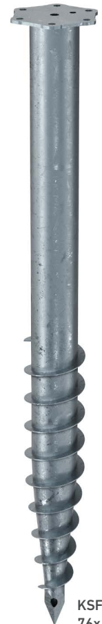
KSF M 76x1000-M12