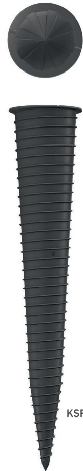
KSF K 60x800