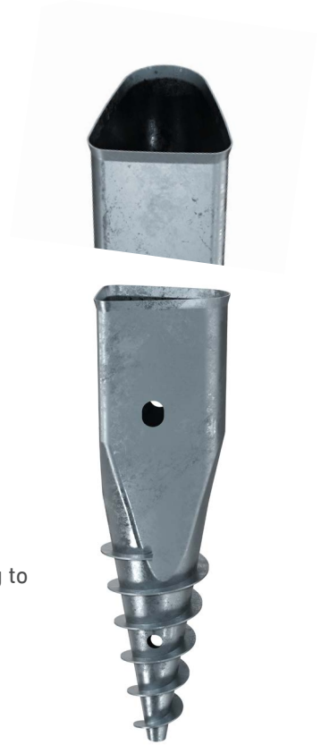
KSF X 130x350-LP