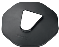
Cover Sleeve-LP Item No. 22801