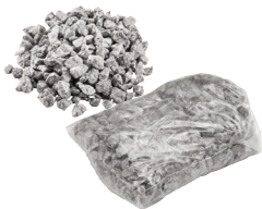
Special Granulate 1500 g Item No. 21824