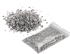
Special Granulate 500 g Item No. 21823